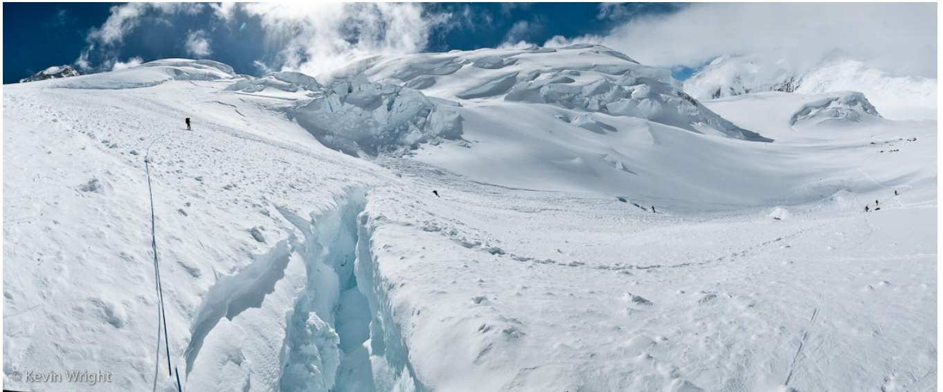
Avalanche track and crevasse in which the victims fell