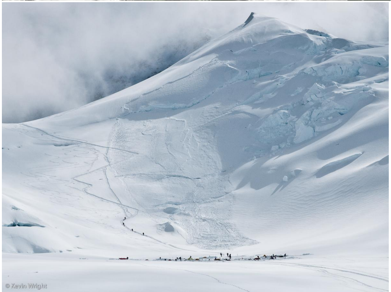
Avalanche, Motorcycle Hill, 11,000 foot camp, and West Buttress trail