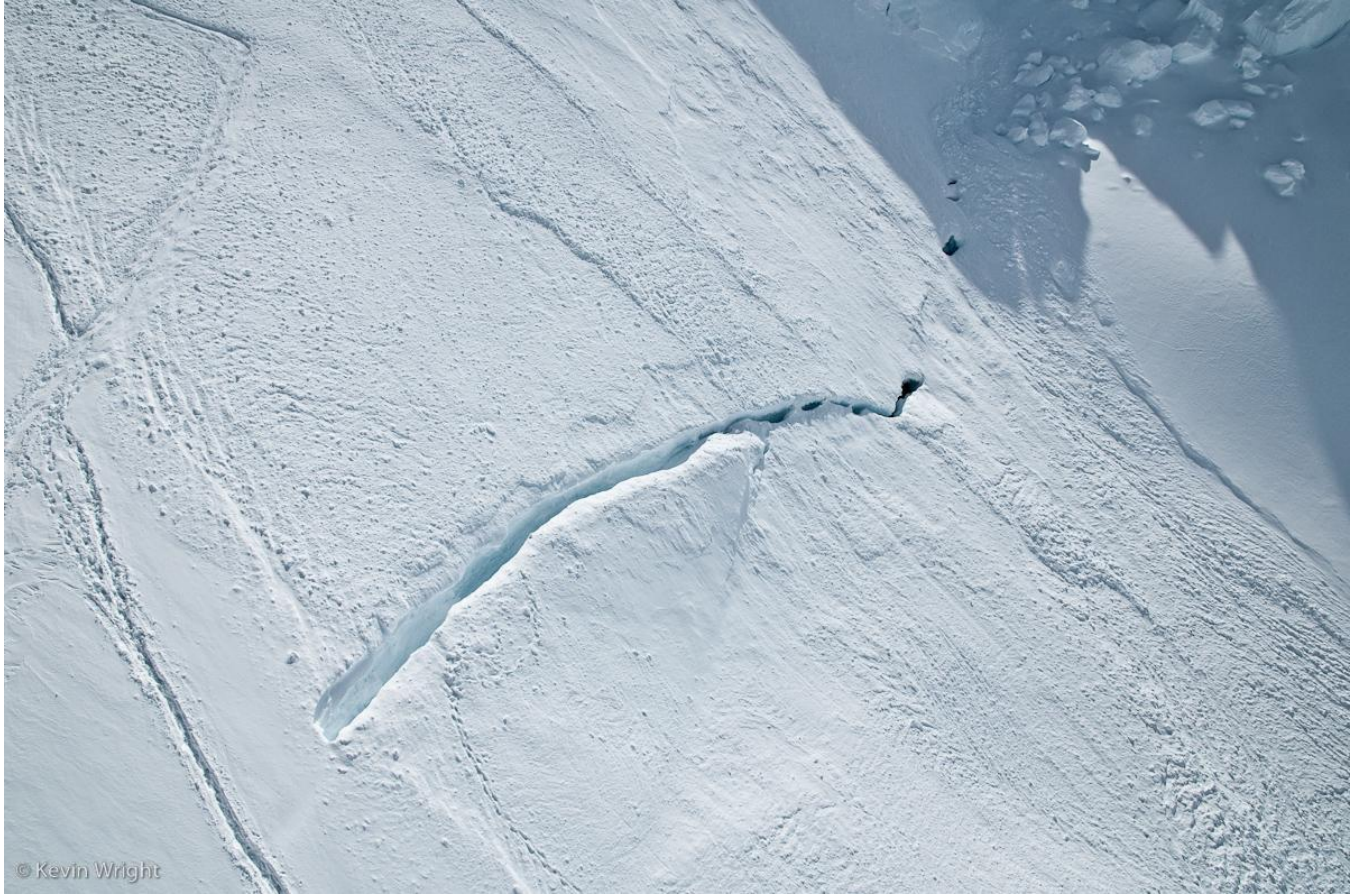
Crevasse where victims fell, note survivor's footprints coming out of the crevasse